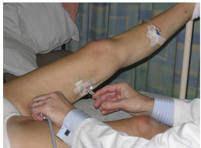
Fig. 2. Foam sclerosant injected via Venflon into the GSV under ultrasound control.

The vast majority (62 of 69, 90%) advised patients to wear compression stockings after the first few days of compression bandaging. These were usually Class II compression stockings (39 of 61, 64%) or